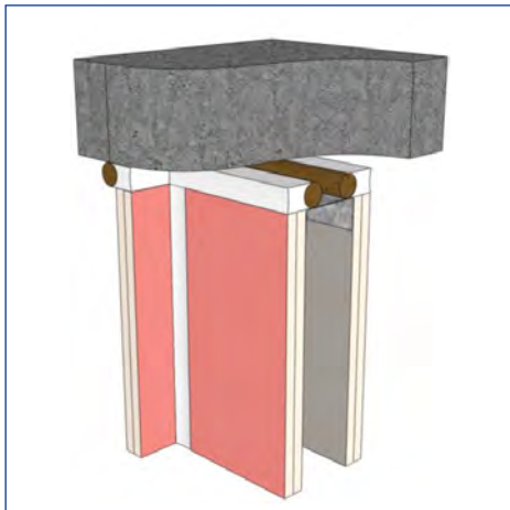
FS702 Intumastic plasterboard to concrete linear gap seal with PE backer rod: EI120